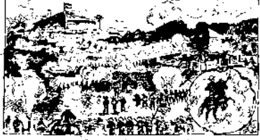
JOE WHEELER'S CHAMBER AT SAN JUAN HILL.